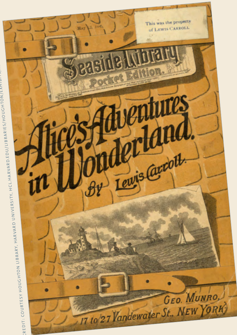
Cover of the unauthorized 1885 Seaside Library edition of Alice that belonged to Lewis Carroll.